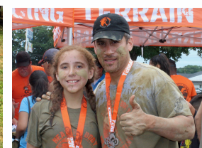
Obstacle Races (Certificate of Completion)