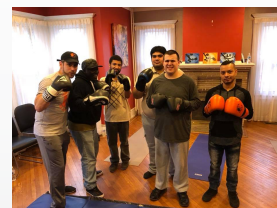
Body T-Fit Boxing (Used as an outlet)