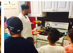
Intro to Nutrition (Intro to Healthy Eating)