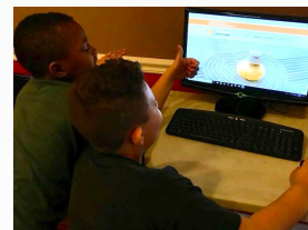
Principle of the Day